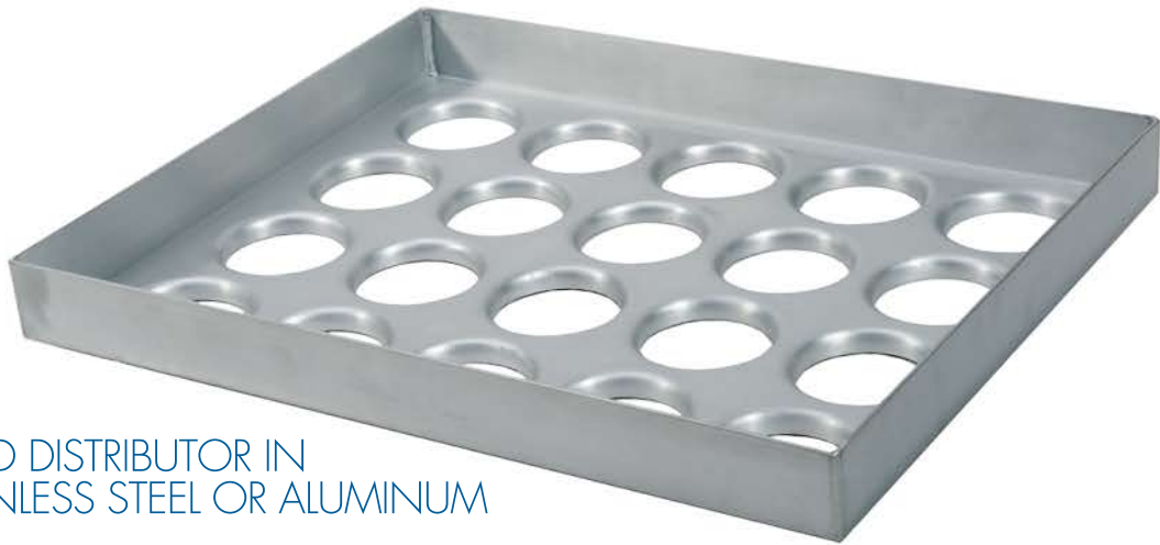
CURD DISTRIBUTOR IN STAINLESS STEEL OR ALUMINUM